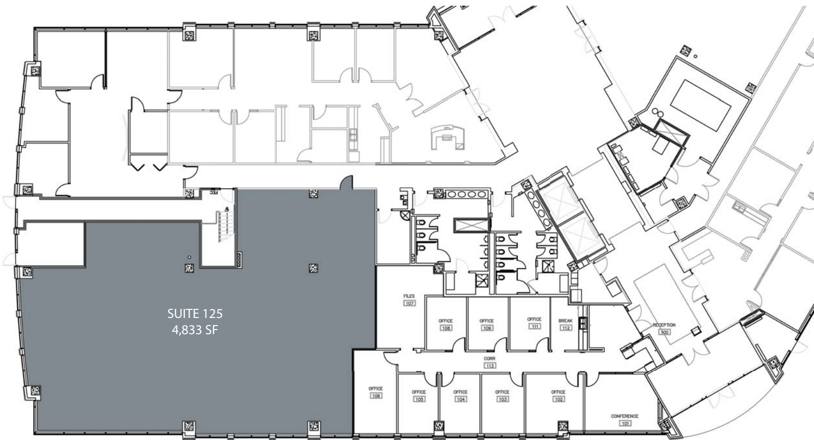
LAS CIMAS IV, 1ST FLOOR